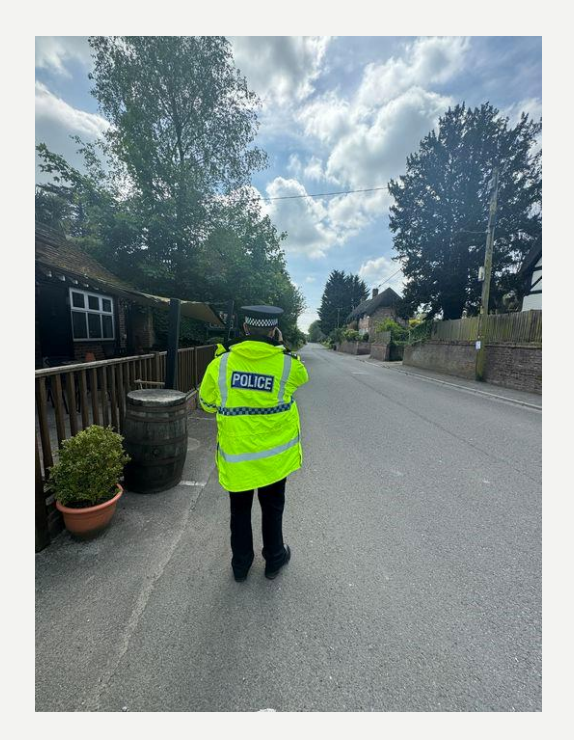
Speed enforcement across the area