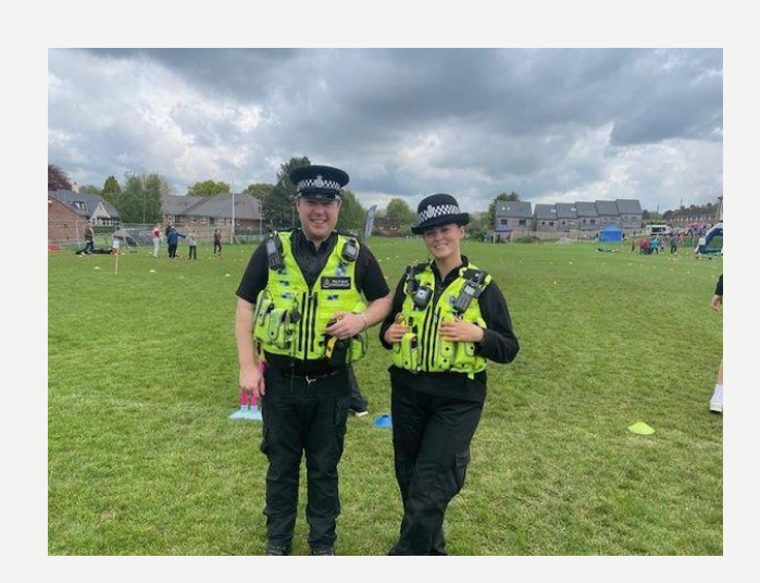
Attending local events