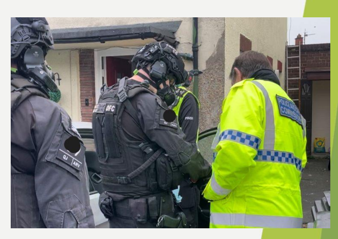
Drug warrants executed in area