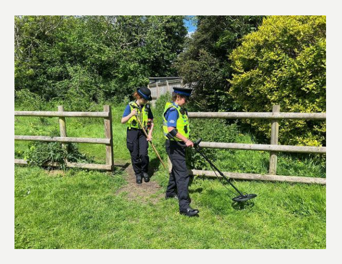
Sceptre- preventative, knife surrender, weapons checks, school talks, test purchases