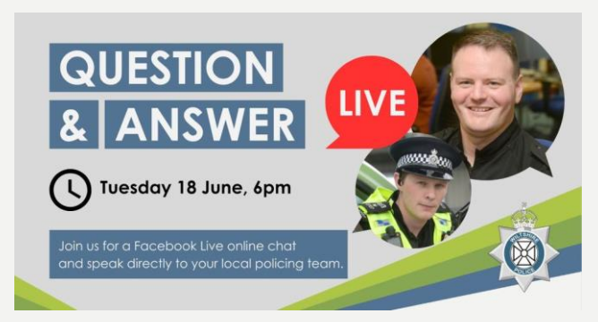
Online engagement and question opportunity